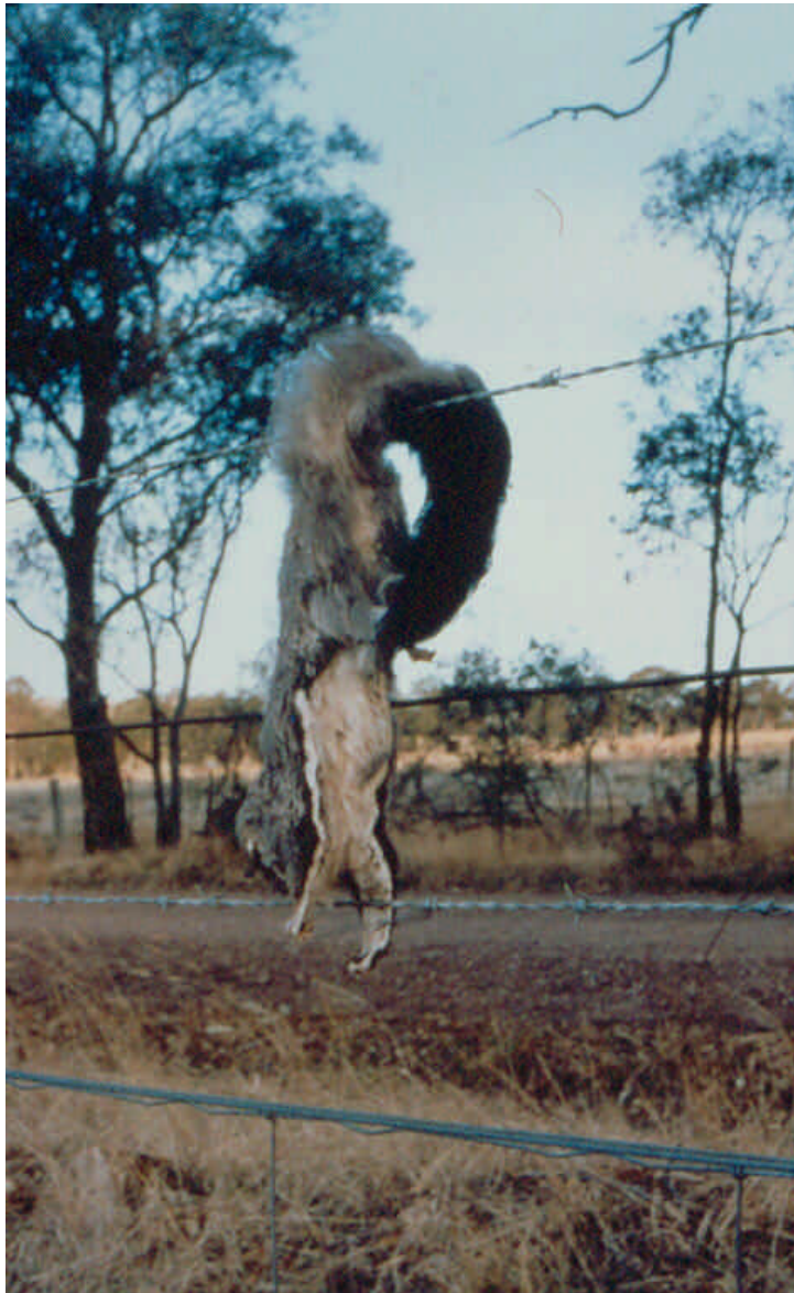
Figure 2. Squirrel Glider caught on barbed wire fence.

The stagwatching survey technique involves observing animals at dusk as they leave the tree-hollow they occupied during the day. Rob Fenton detected Squirrel Gliders leaving a dead tree with hollows located east of the train line in November 2002 (Rob Fenton, pers. comm.). Two Squirrel Gliders were observed on the 30 th and 31 st May 2003 leaving the same hollow in a tree on Central Reserve Road by Damian Michael (pers. comm.).